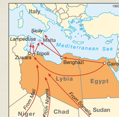
Migration routes to Europe

Some 6,000 migrants - more than the total population of the island - are now living there in makeshift camps 11 .